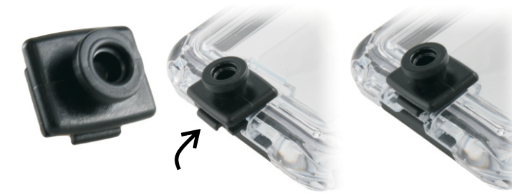
RAM BELT CLIP BUTTON RECEIVER SECURES OVER BELT CLIP BUTTON ADAPTER.

SLIDE BUTTON ADAPTER INTO BOTTOM SLOT OF AQUA BOX® PRO. PRESS FIRMLY TO CLICK BUTTON INTO PLACE. COMPATIBLE WITH STANDARD AFTERMARKET BELT CLIP BUTTON RECEIVERS.